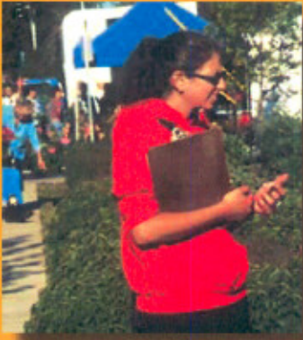
Entering shoppers are counted for 10 or 20 minutes.

Also, the 20-minute and 10-minute periods are more easily staffed than when a count is taken throughout the market's duration.