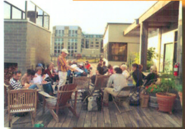
Carefully train RMA team members.