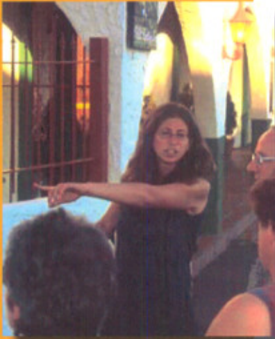
Touring the market site the night before an RMA

stand-alone exercises undertaken by individual markets, a CCO is a part of a complete RMA.