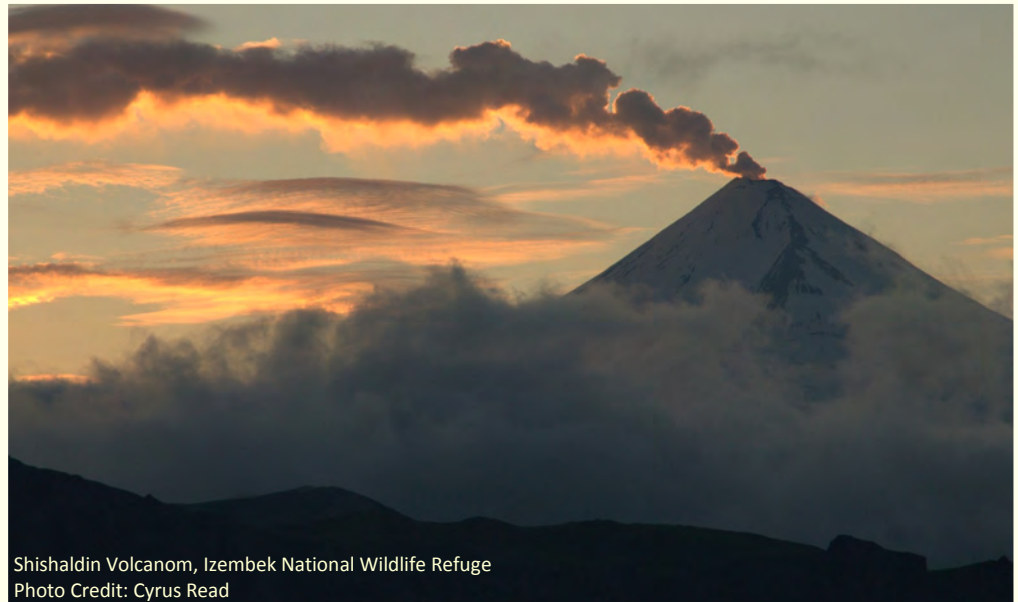
Shishaldin Volcanom, Izembek National Wildlife Refuge

Friday, April 30 – King Cove, Multi-Purpose Building @ 2 pm