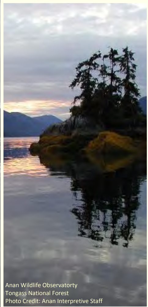
Anan Wildlife Observatory Tongass National Forest

The USDA Forest Service is holding two roundtable sessions in Juneau to give the public an opportunity to provide input on the new planning rule. The planning rule is used as a guide for development of individual forest plans. It attempts to answer broad questions such as what they are trying to do, what should be studied and considered, and how they will know if they are doing what they wanted. Individual forests will then use this planning rule to create land management plans specific to that unit.