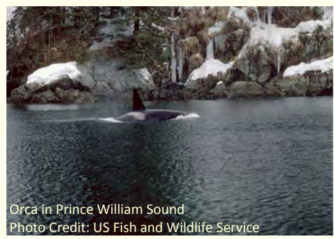
Orca in Prince William Sound