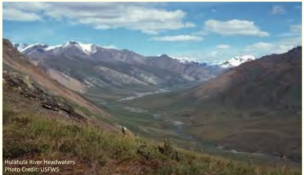
Hulahula River Headwaters