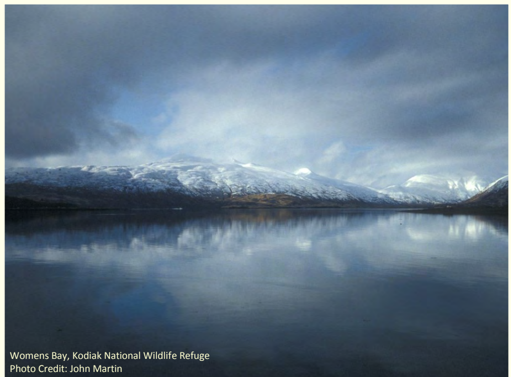
Womens Bay, Kodiak National Wildlife Refuge