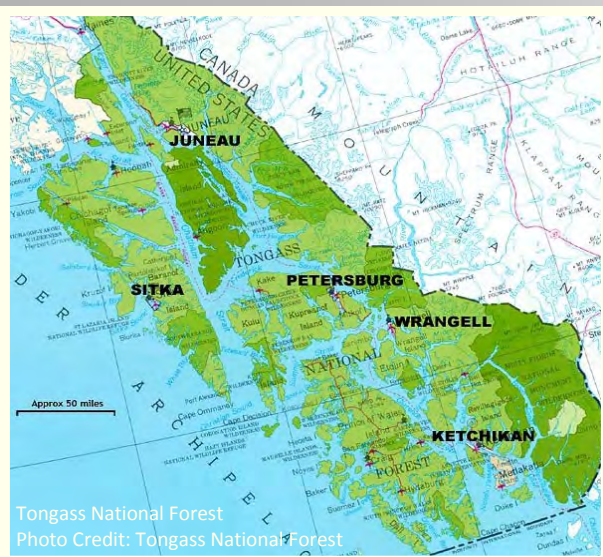
Tongass National Forest

The Tongass National Forest will need to use a helicopter, a rock drill, a generator, wheelbarrow and power tools to install the structures. Sites that are within wilderness will be required to go through a Minimum Use Decision Guide. Comments on the scoping phase of this proposal can be sent to Michelle Putz, Team Leader, 204 Siginaka Way, Sitka, AK 99835 or to comments-alaska-tongass@fs.fed.us with "Radio" in the subject line. Comments are due May 7, 2010.