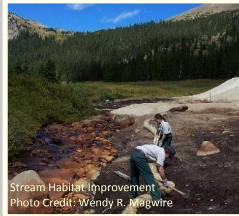
Stream Habitat Improvement

More than $23 million in American Recovery and Reinvestment Act (ARRA) funds went to the Tongass National Forest to pay for nearly 40 projects in Southeast Alaska. The purpose of these funds is to stimulate the local economy