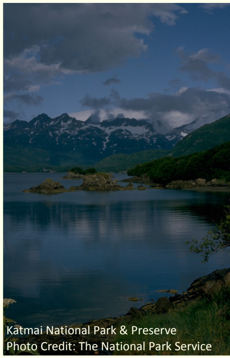
Katmai National Park & Preserve