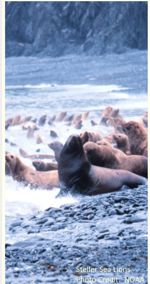
Steller Sea Lions