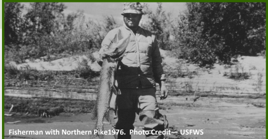
Fisherman with Northern Pike 1976.