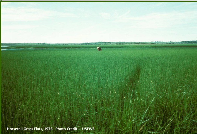
Horsetail Grass Flats, 1976.