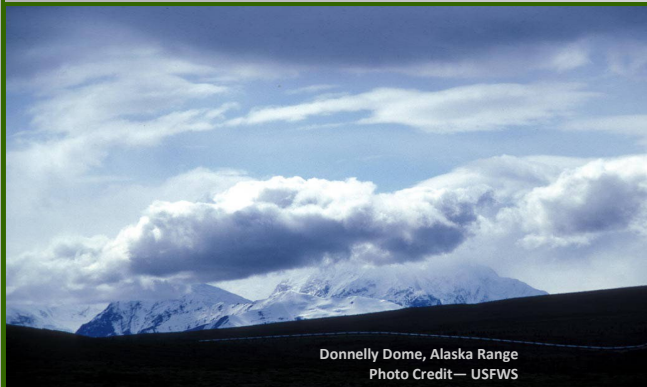
Donnelly Dome, Alaska Range

Weather and Climate Monitoring Program at Glacier Bay NPP - Comment Period Extended for NPS Draft Land Protection Plans - Secretary Vilsack Announces Steps to Transition the Tongass to Second Growth - 4 Wildlife and Hunting Heritage Conservation Council Teleconference -