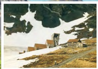
Bruce I. Staser Family, Papers, circa 1956 UAA-HMC-0232

In 1896 prospectors struck gold in Crow Creek, which became the most productive placer gold stream in Southcentral Alaska. Monarch Mine operated from 1906 to 1948 on upper Crow Creek and was one of the most productive load gold mining ventures on the Turnagain Arm. Rusted remnants from the mining camp can still be seen off a fork of the trail about 1.25 miles from the Crow Creek Trailhead.