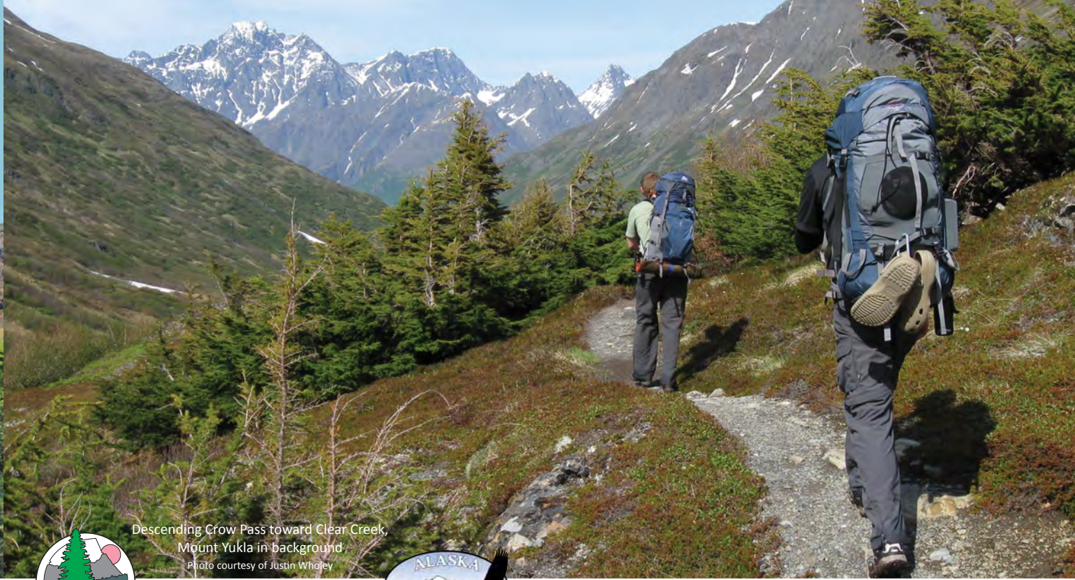
Descending Crow Pass toward Clear Creek, Mount Yukla in background.