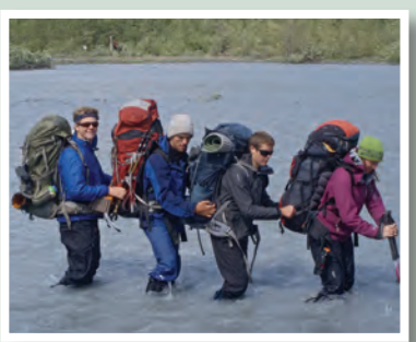
Crossing rivers and streams in the backcountry can be dangerous. Learn the techniques before you head out.