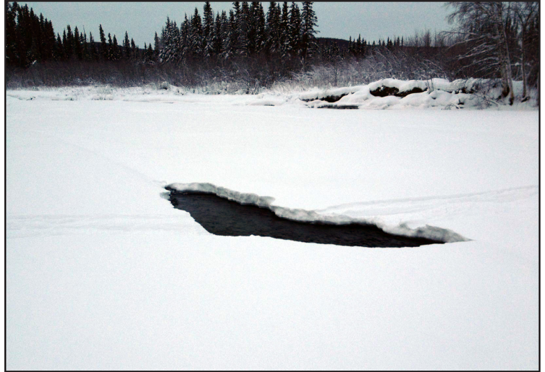
The ice dropped out behind Ranger Ian Thomas as he was checking conditions on the trail to Nugget Creek public-use cabin, leaving a black hole in the Chena River. Luckily, the water was only 20 inches deep and he was able to throttle out without getting wet.