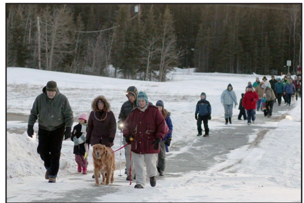
First Day hikers take to the trails in Delta Junction