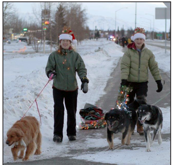
Hikers who took the "Walk of Lights" seriously and brought their own glow spread some extra holiday cheer