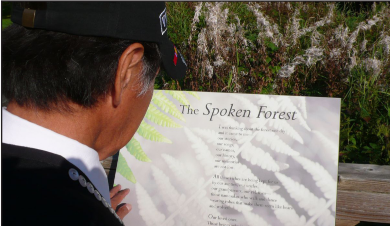
A visitor reads a poem installed in Totem Bight SHP