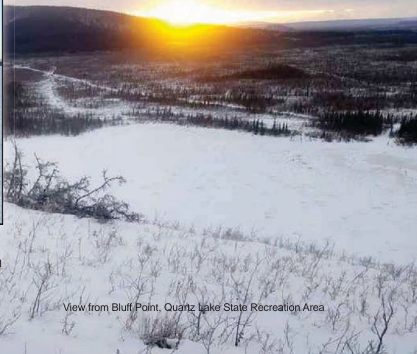
View from Bluff Point, Quartz Lake State Recreation Area