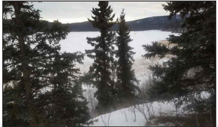
The view from the Glatfelder Public-Use Cabin allows visitors to glimpse ice fishing shacks dotting the far end of Quartz Lake.