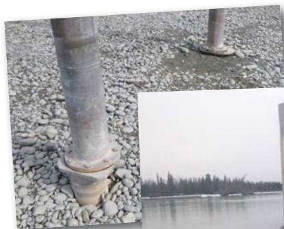
Above: The piles before replacement