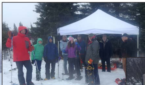
Skiers and snowshoers prepare to take to the trails in Eveline SRA.

A couple of volunteers stayed at the trailhead to set up the shelter, fire, and refreshments. A canopy was prepared for folks to get out of the mixed rain and snow, allowing them to warm up with hot chocolate and hot cider, grilled hotdogs, and a warming fire and maybe dry off a bit. Despite the foul weather, folks seemed to have a great time and Friends of Kachemak Bay State Parks had a few new members sign up.