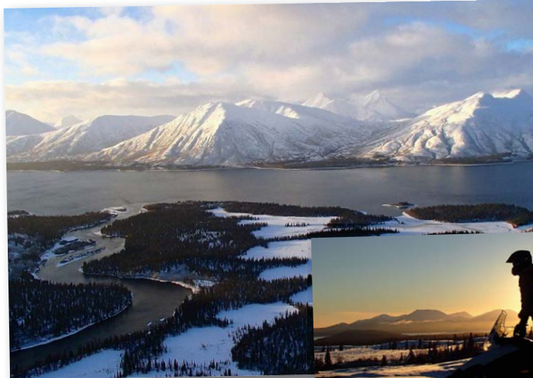
Above: Agulowak River flows into Lake Aleknagik.

Warm temperatures and low snow accumulation in southwest Alaska has affected winter travel this season. Large areas of open water remain on several lower lakes in Wood-Tikchik State Park. Lake Beverley, Lower Nerka, and Lake Aleknagik had yet to completely freeze in January—an unusual sight for this time of year. The normally popular snowmachine route across Lake Aleknagik is mostly open water. Some snow and ice in the eastern reaches of the park are providing overland travel. Trail conditions are rough, but hearty recreationalists are making due—especially when they get a few inches of fresh snow.