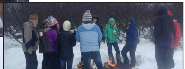
Kachemak Bay First Day Hike event participants warm up by the fire with hot cocoa and cider.