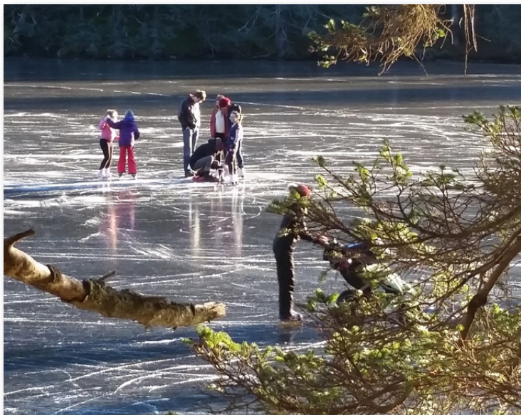
Ice skaters on Lake Gertrude in Fort Abercrombie State Historical Park