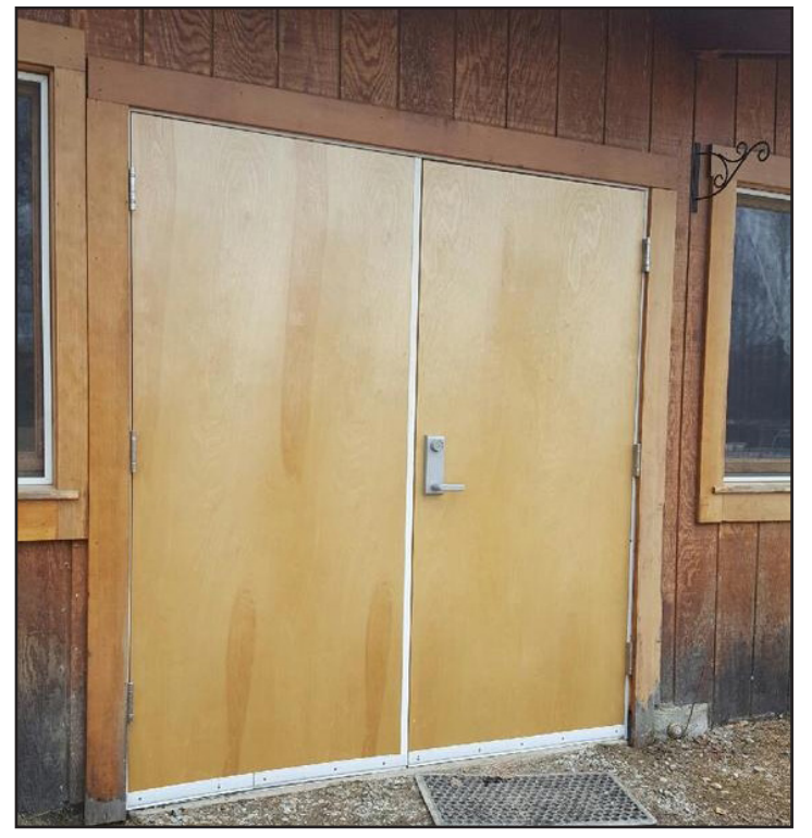
New doors installed at Rika's Café and Gift Shop

Northern Area maintenance workers are helping get Rika's Café and Gift Shop open for the season. New doors have been installed, a commercial dishwasher plumbed, LED lights put in, drywall repaired, fire extinguishers serviced, and the water system turned on.