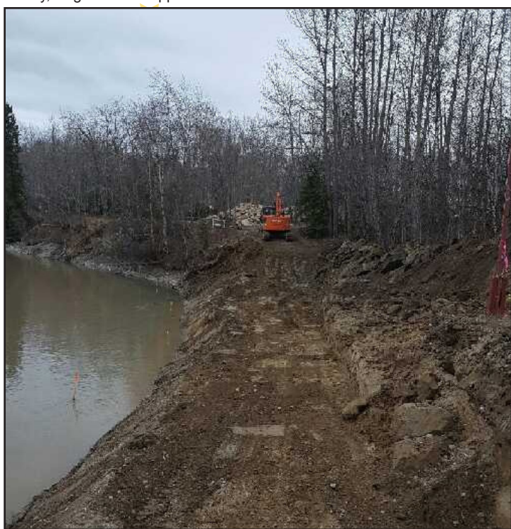
The bank stabilization project at Big Delta State Historical Park is underway. The project will protect four historic structures threatened by the Tanana River. Funding for the project came from a variety of private foundations, local businesses, and the federal Historic Preservation Fund program.

Eagle Watch is a monthly newsletter published by the Division of Parks and Outdoor Recreation www.alaskastateparks.org