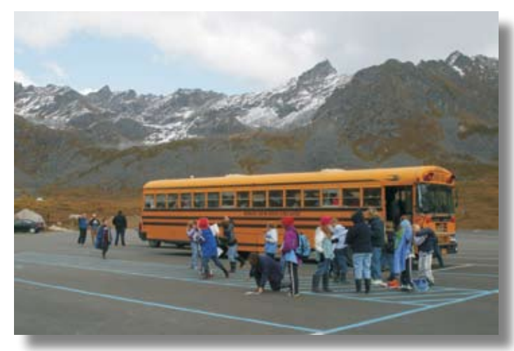
Educational programs, Independence Mine, Hatcher Pass