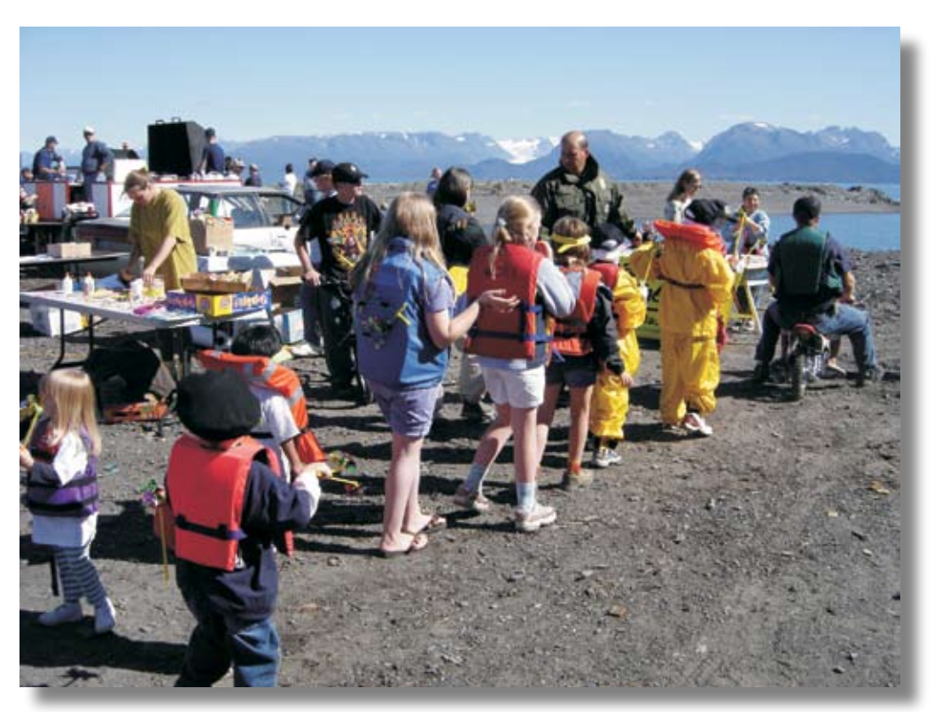
Boating Safety staff with school group